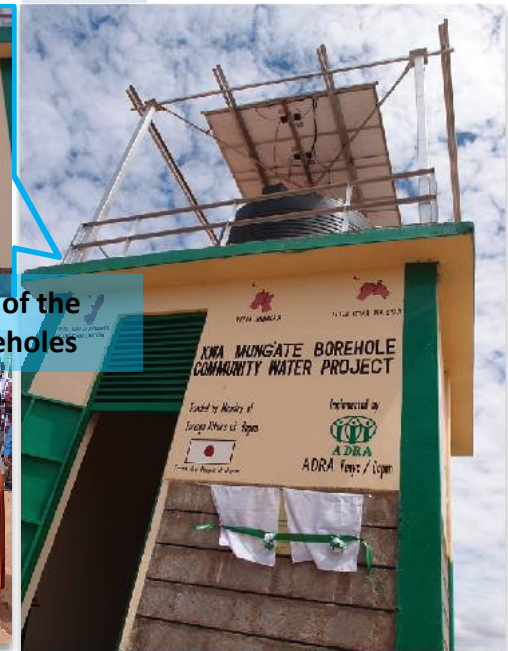
One of the Boreholes