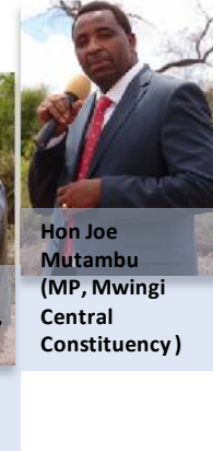
Hon Joe Mutambu (MP, Mwingi Central Constituency)