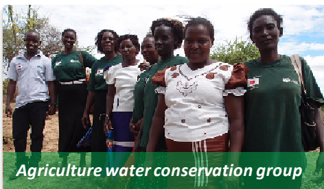
Agriculture water conservation group