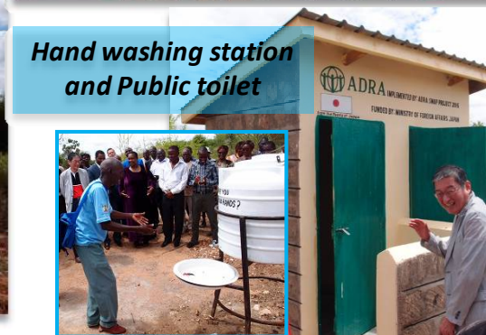
Hand washing station and Public toilet