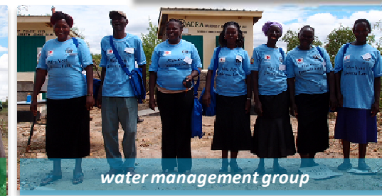
water management group