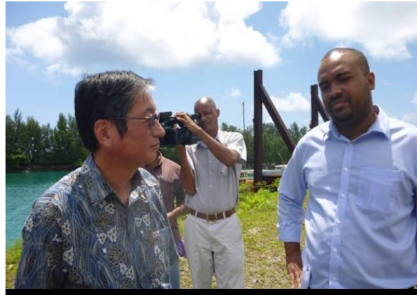
H.E. Amb. Terada and Minister Cosgrow exchanging views during the site visit