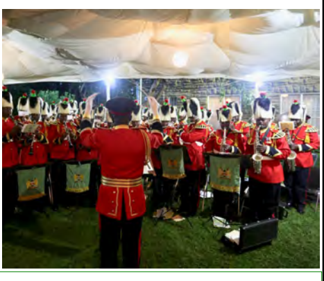
Kenya Defense Forces Band performing the National Anthems of Japan and Kenya

support efforts by the Government of Japan across Africa echoing the examples of the Japan led African Rapid Deployment of Engineering Capabilities (ARDEC) and the Japanese vessels providing support across the Gulf of Aden. Major General Mulata extended his gratitude to the Government of Japan being one of the primary partners of the International Peace Support Training Centre.