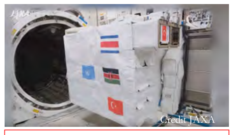
Kenya's first Satellite, 1KUNS-PF ready for deployment.