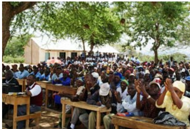
The community applauds after the check is handed over.