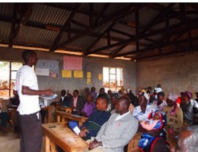
A Cross Section of Health Workshop conducted by HANDS under the Grant Assistance

From January to March , 4 Grant Assistance for Japanese NGO Projects mentioned below were signed at the Embassy of Japan. More than 30 development projects in Kenya implemented by Japanese NGO have been awarded this Grant Assistance since 2004.