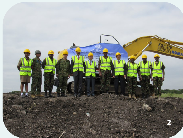
2. A group photo during the ARDEC workshop