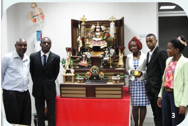
3. Tuwakuze Africa Youth Group Visits the Embassy

Tuwakuze youth group members posing next to the Gogatsu Ningyo boys display at the JICC library during a cultural visit to the Embassy.