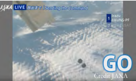
Kenya's Satellite finally deployed into space!

At exactly 1.30 pm East African Time on the 11th May 2018, Kenya's first satellite (1KUNS-PF), developed with support from JAXA and UNOOSA under the "KiboCUBE" programme, was deployed into space. The Embassy of Japan in conjunction with the University of Nairobi (UoN) held a Public Viewing of this deployment which was televised live.