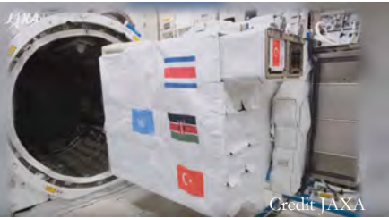
Kenya's first Satellite, 1KUNS-PF ready for deployment.