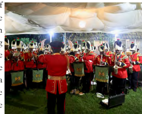
Kenya Defense Forces Band performing the National Anthems of Japan and Kenya