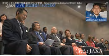
The audience watching the live deployment from the Tsukuba, Japan.