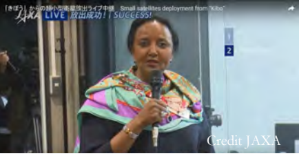
Ambassador Amina Mohamed, Cabinet Secretary for Education, giving remarks on behalf of H.E. President Kenyatta.