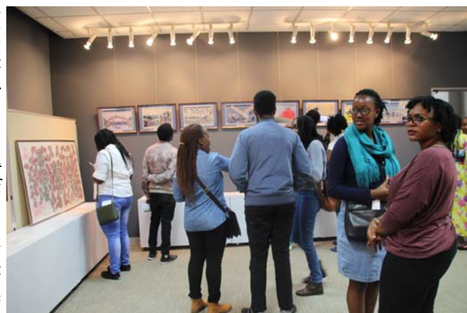
Visitors looking at exhibited art at the Japan Information and Culture Centre