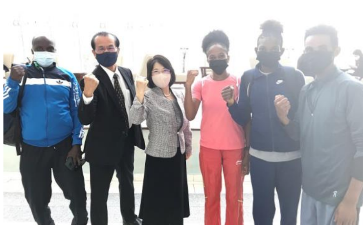
H.E. Ambassador HORIE wishes the best of luck to the Tokyo 2020 Olympic Athletes