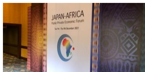
Caption: The 2nd Japan-Africa Public-Private Economic Forum (On 7th and 8th December 2021)