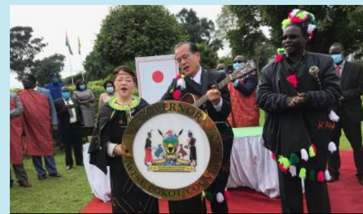
Signing ceremony for project (10) with West Pokot County Governor