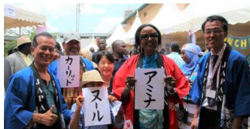
The 1st Japan Day in 2019 with Amb. Amina Mohamed and her family