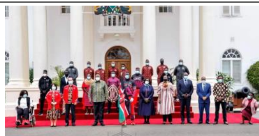
Tokyo 2020 Olympic and Paralympic Games Flag Handover Ceremony