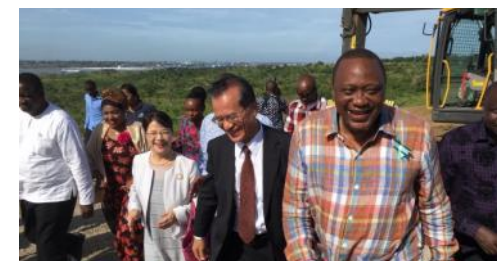
Caption: Ground Breaking Ceremony