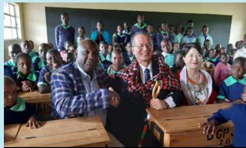
Handing-over ceremony for project (B) with Narok County Governor