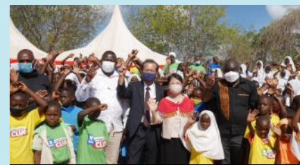
Handing-over ceremony for project (a) with Kwale County Governor