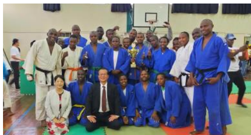
Judo Japanese Ambassadors Cup in 2019