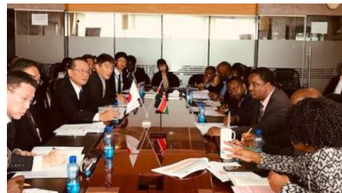
Caption: The 2nd Japan-Kenya Business Dialogue (On 12th March 2020)