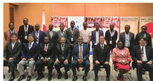
Youth from Kenya and Somalia gather for the ABE Initiative and the KIZUNA program Send-off Ceremony